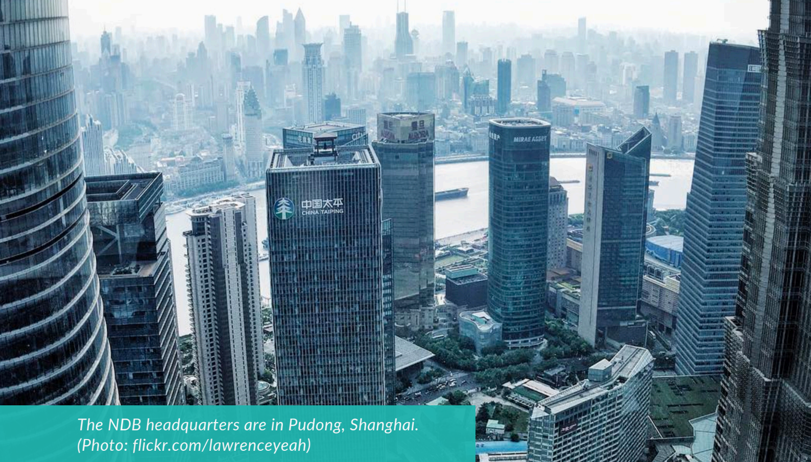
The NDB headquarters are in Pudong, Shanghai.