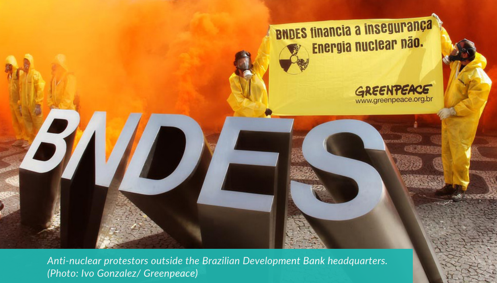
Anti-nuclear protesters outside the Brazilian Development Bank headquarters.